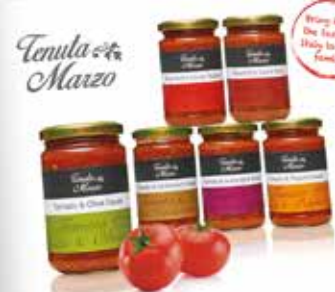
Tenuta Marzo Tomato Sauces

Tenuta Marzo tomato sauces are produced by a family-run business in beautiful Tuscany, Italy. They are made with the finest ingredients and are perfect for use with pasta, risotto or as a dip.