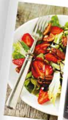
Strawberry and Pican Salad

Fresh strawberries Crusty salad leaves Whole pecan nuts Condiments: Balsamic Vinegar Dress with honey & vanilla